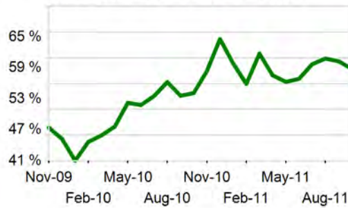
Top Ten Market Share Two Year Trend