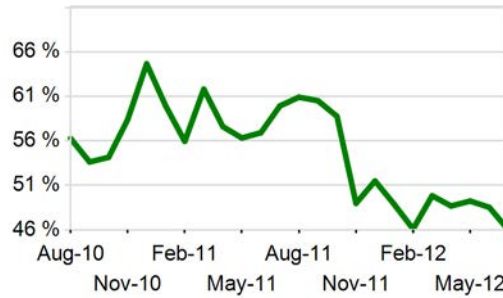
Top Ten Market Share Two Year Trend