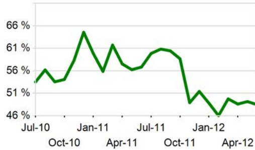
Top Ten Market Share Two Year Trend